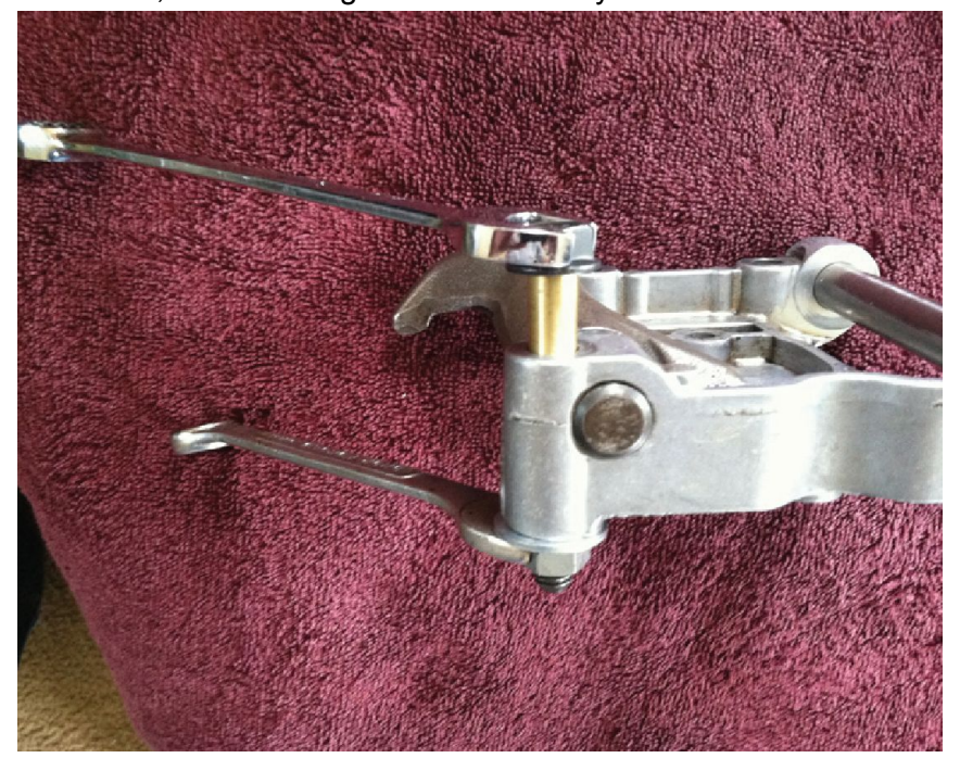
Here is what it will look like installed.

This photo shows the Rocker Locker being pressed into the support plate by slowly turning the bolt with a wrench, while holding the nut stationary with another wrench